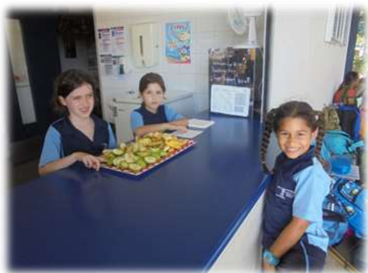
Getting Afternoon Tea ready

Parents have a responsibility to inform the Director or staff of any special dietary needs their child/ren may have. Children are encouraged to serve themselves and staff will serve hot food.